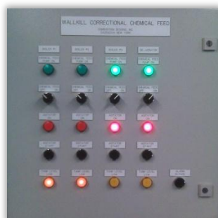
Process Control Panel