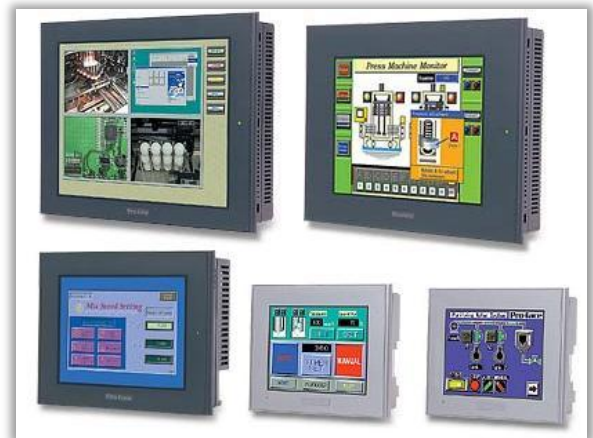
Example Touch Screen HMIs